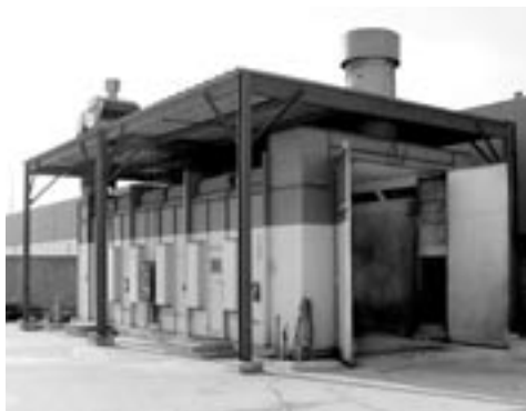
Outdoor Spray Booth

As with all our available properties, a full commission will be paid to the procuring broker.