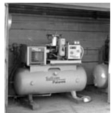
Compressed Air System