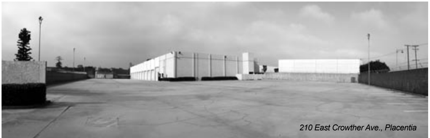
210 East Crowther Ave., Placentia