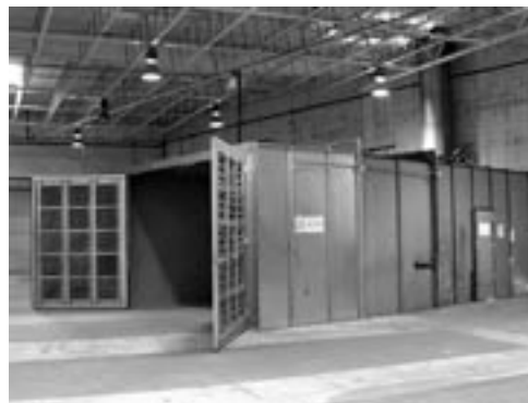
Indoor Spray Booth